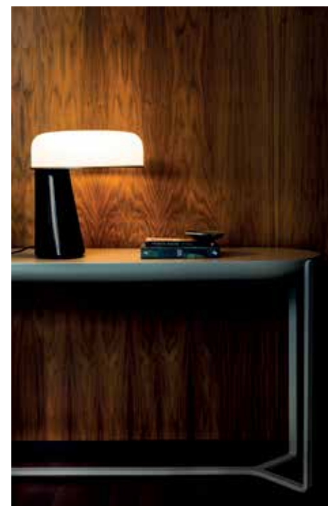
Above: Doshi Levien for John Lewis Ballet console table, £499, and Falcon lamp, £199.