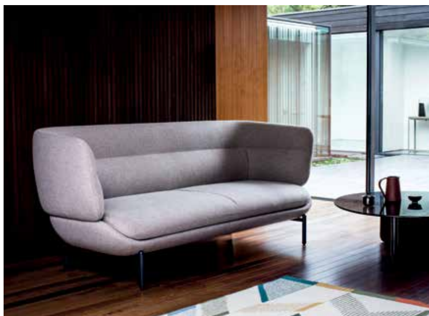
Below: Pondok sofa, £2499, and Phulkari rug, £495.